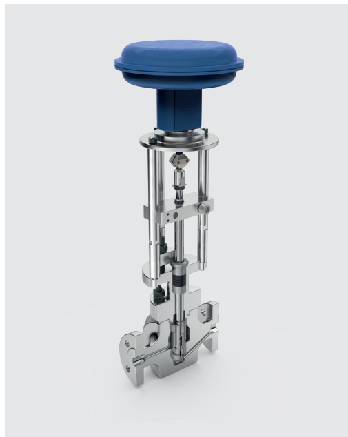
> Type AK, sectional view