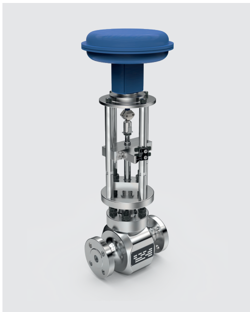
> Type AK, front view

High pressure control valve with axial throttle body