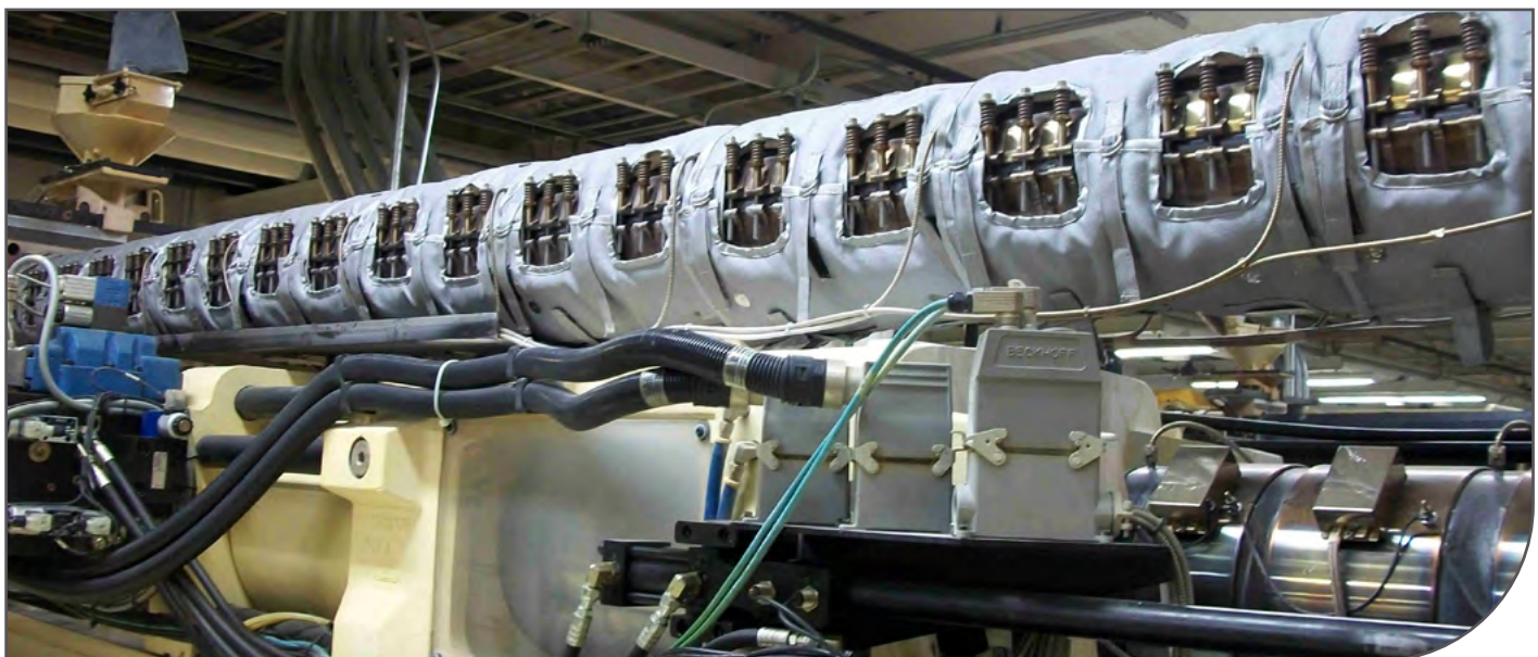
18" OD Extruder Barrel