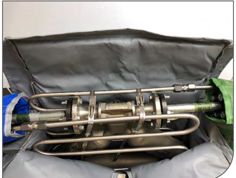
Integral Steam Heat Kit & Gate Valve Blanket