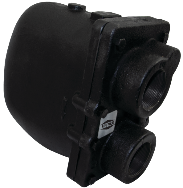
Figure 1. High Capacity Steam Trap

The FTH Series are float and thermostatic steam traps. The float actuates the valve via a hinged lever and linkage. The air vent is a balanced pressure design with stainless steel welded encapsulated bellows capable of discharging air and non-condensable gases continuously. The traps are cast iron bodied suitable for pressures to 200 psi / 13.8 bar with NPT connection.