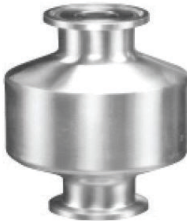
Figure 1. DS100 Series Thermostatic Steam Trap