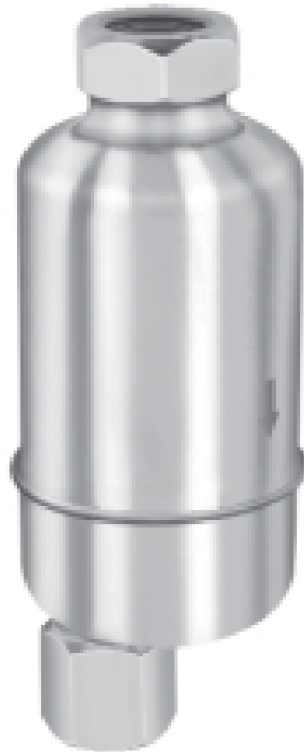
Figure 1. Type NLD Free-Floating Lever Drainer